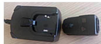
100-240V Power Supply

Model : 90ACC1885 Description : Power Cord, 2-Pin, EU