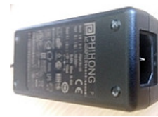
100-240V Power Supply

Model : 6003-0940 Description : Power Cord, AC, IEC/EU