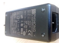
100-240V Power Supply

Model : 6003-0940 Description : Power Cord, AC, IEC/EU